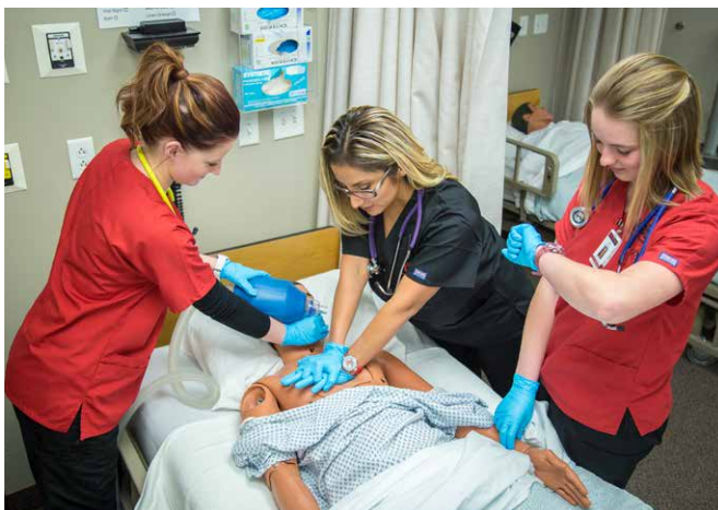
*Text and/or supplies may be required