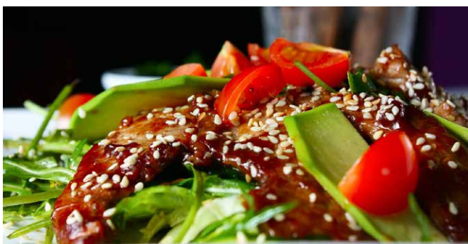
*Text and/or supplies may be required

CULA 0101 LC Full Course Arranged $170 CULA 0102 LC Re-Certification Arranged $75