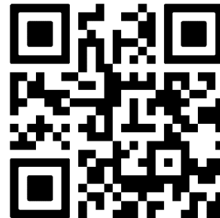
QR Code for Course Registration