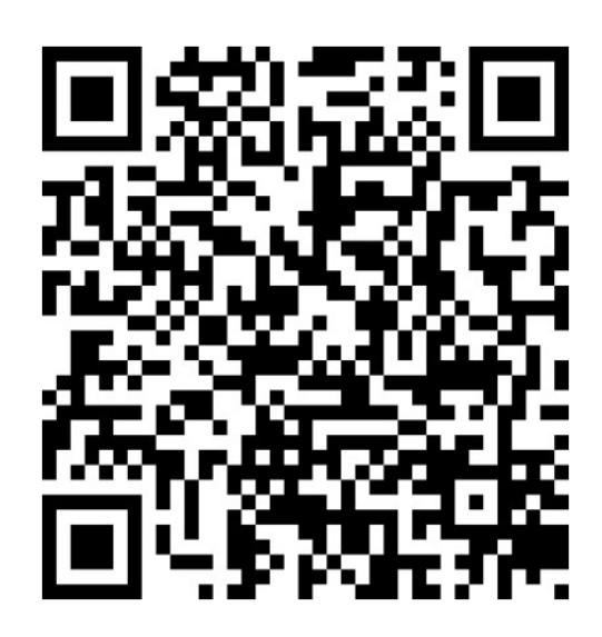
QR Code for Course Registration