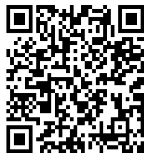
QR code – class registration